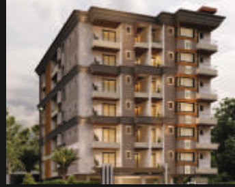
Green Palm Palm Drive, Mahaveer Nagar, Jaipur