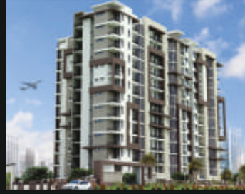
Acacia Near Jawahar Circle, Jaipur