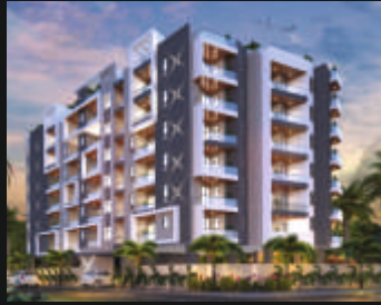
The Laburnum Janpath, Shayam Nagar, Jaipur