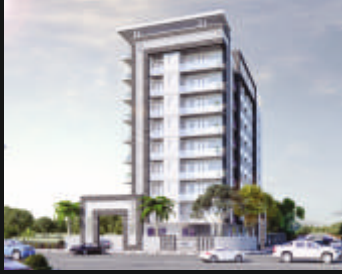
Suhag Residency Vidhyadhar Nagar, Sikar Road, Jaipur