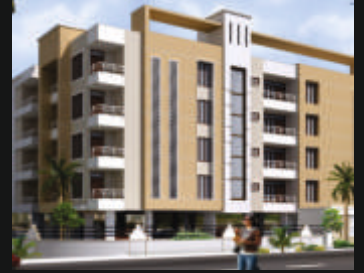
Aashish Saffire Civil Lines, Jaipur