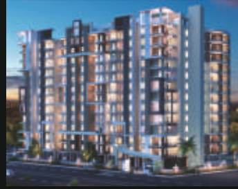
Pamposh Jawahar Circle, Jaipur