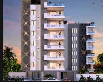
Siya Homes Vaishali Nagar, Jaipur