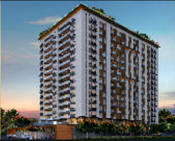
Central Park C-Scheme, Jaipur