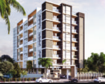
The Palm Palm Drive Mahaveer Nagar, Jaipur