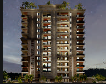
The Meridian C-Scheme, Jaipur