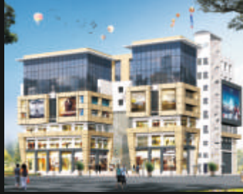
Aakash Multiplex Aerodrome Circle, Kota