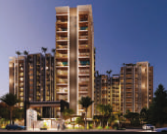
The Palladium Near International Airport, Jaipur