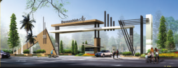
Devaashish City Gramin Police Line Road, Borekhera, Kota