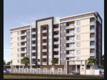
Satyam Near Dhanwantri Hospital, Jaipur