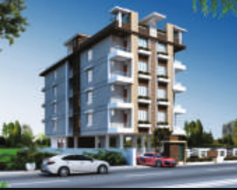
Westend Bapu Nagar, Jaipur