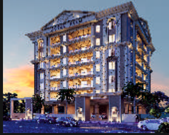
Royal Palm Palm Drive Mahaveer Nagar, Jaipur